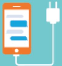
cell phone charger