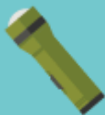
flashlight and flares