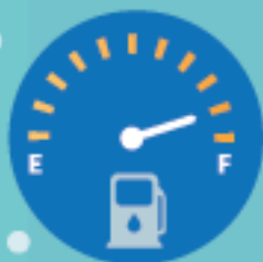
full tank of gas