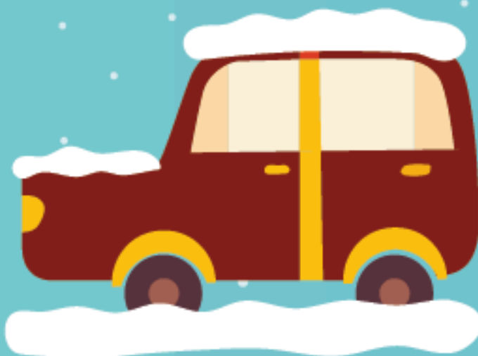
ice scraper/ snow brush & shovel