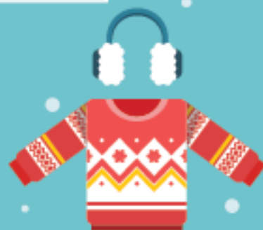
extra clothes, boots, gloves, hat