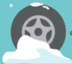
snow tires or chains & jumper cables